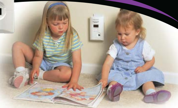
Install a CO alarm today and protect your family

because you can't see it, taste it or smell it. The only way to detect the presence of the deadly gas is to install a carbon monoxide alarm. On October 15, 2014, the Ontario Government formally enacted a new law - The Hawkins-Gignac Act - making carbon monoxide alarms mandatory in all Ontario homes at risk of CO. This revision to the Ontario Fire Code, supersedes any existing municipal by-laws.